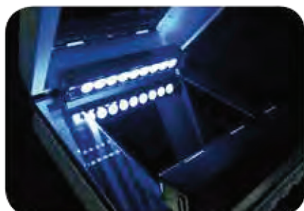
Built-in blue LED module provides flexibility in DNA stain selection