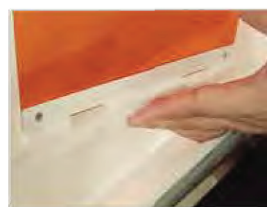
Removable amber Filter