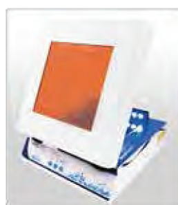
Blue light applied