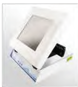
UV light applied